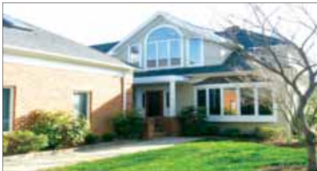
Wonderful 2 story town home with vaulted ceilings offers hardwood floors, fine trim detail, skylights, butlers pantry with wet bar, 3 bedrooms 2 1/2 baths and excellent storage. Great screened porch overlooks green space. Priced $50,000 below assessed value and close to W&L. This is a terrific opportunity in a fine town-home neighborhood. $425,000