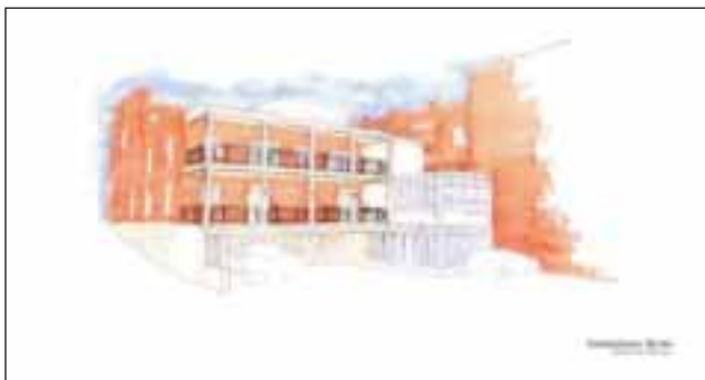
One Sheridan Row is a luxury condominium created as part of the historic renovation of the Sheridan Building in downtown Lexington, VA. This 2 bedroom, 2 bath home has a wonderful fireplace & outside rooftop patio. Original flooring & period trim have been retained in the design where ever possible. The sunny den & master suite are graced with beadboard wainscoting original to the building. $545,000