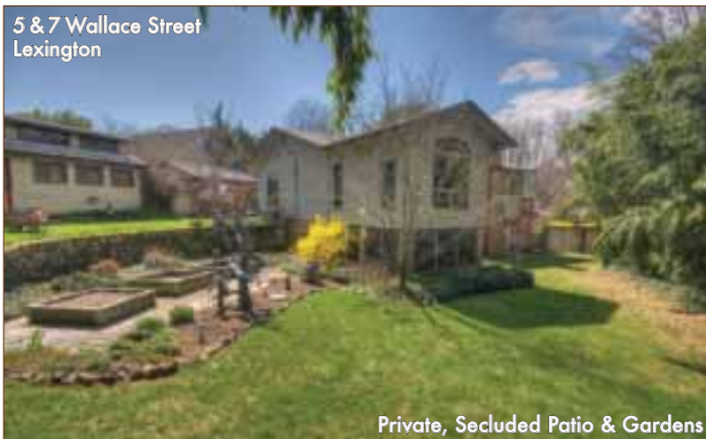
Private, Secluded Patio & Gardens