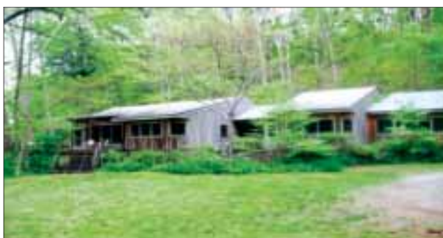
Incredibly serene Passive Solar home designed by local architect (Lee Merrill). The 3 bedroom, 2 bath rustic contemporary home sits along Poague's Run with access via a low water bridge over Buffalo Creek. This amazing property is not far from Historic Lexington, Virginia but worlds away from the ordinary! Great room with woodstove and extensive decking overlooking the year round stream. $285,000