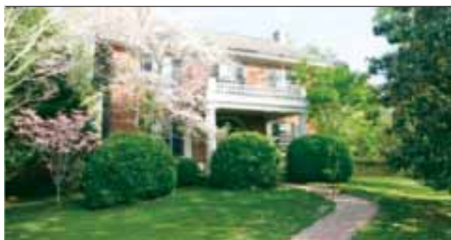
Rare find on Jackson Ave.! A solid brick home within walking distance of downtown, schools, W&L, and VMI. Beautiful landscaping, fenced front and back yards, front and back porches, stone patio and detached garage. House has a delightful kitchen, large living room with fireplace, cozy den, 2 bedrooms and a master suite and a large finished attic room with skylights and windows. $524,500