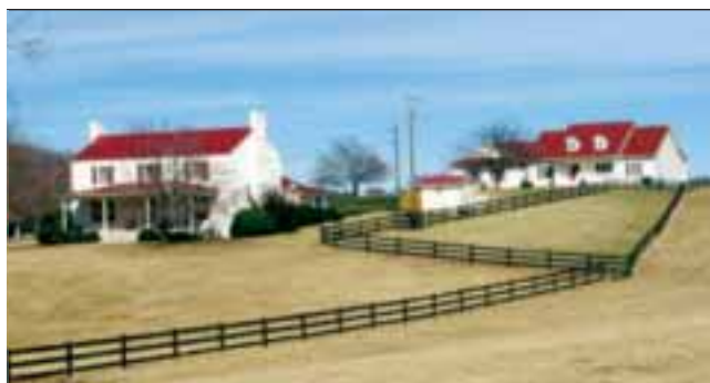
This lovely 27 acre Rockbridge County farm offers a traditional brick farmhouse (ca. 1850) and a wonderful guest cottage built in 2002. The farm consists of a post and beam bank barn, equipment barn, brick spring house, original one room log structure, and a swimming pool. This fine property is in beautiful condition and a rare offering between Fairfield and Brownsburg. $679,000