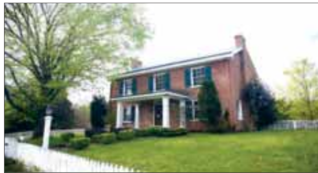
Fully renovated brick manor home (ca.1840) with a long boundary along Lake Robertson grounds. Original floors, woodwork, and mantels at 4 fireplaces are examples of period architecture. Bold creek, studio/workshop, and abundant wildlife compliment this very private property. 74+/- acres adjoins over 500 ac. of State land for buffer and enjoyment. $575,000