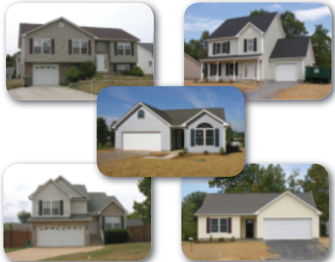
Homes above are similar to those scheduled to be built