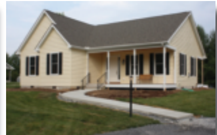
New ~ One Level ~ Space Efficient