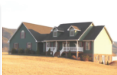
In the Shadows of the Blue Ridge 3.8 Acres