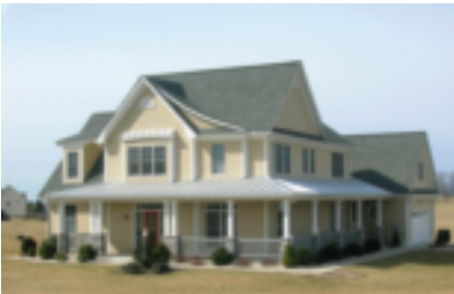
Style & Comfort Raphine Area ~ 2 Acres

PLANNED WITH NATURE IN MIND. Be a part of the Ponds lifestyle and enjoy the many amenities that the Ponds has to offer. Community building with exercise room, indoor heated pool, outdoor pool, large patio and banquet room for private parties. Ponds for the fishing enthusiast or just to relax by. Building lots, with public water and sewer available, priced from the mid-50's. Financing options available.