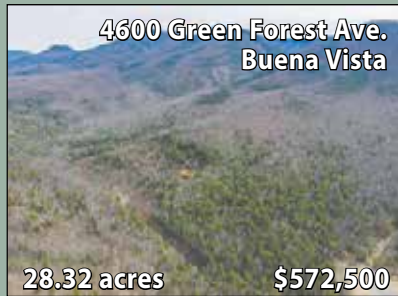
4600 Green Forest Ave. Buena Vista

Mixed use land, 9 acres cleared, Only 2 miles from Lake Robertson Recreation area, 15 minutes from downtown Lexington for shopping, restaurants & entertainment.