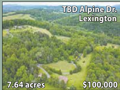
TBD Alpine Dr. Lexington

Build your dream custom home on this elevated, oversized lot!!! Situated on a cul-de-sac within Lexington Golf & Country Club. All utilities are available.