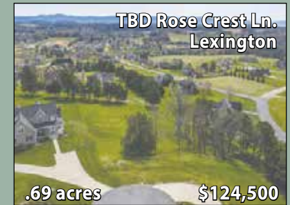
TBD Rose Crest Ln. Lexington

.70 acre, highly visible commercial building site, zoned Light Manufacturing. Public Utilities available. Great business spot, right in the heart of Buena Vista!