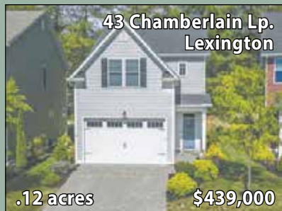
43 Chamberlain Ln. Lexington